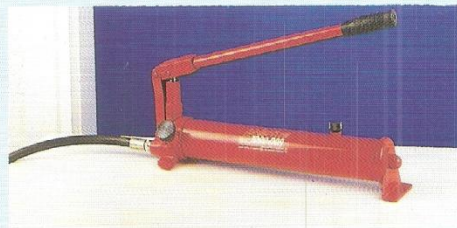
HAND PUMP HN-5262

*WEIGHT.....5.7 Kg *LENGTH.....500 mm *WIDTH.....110 mm *POWER.....400 Bar