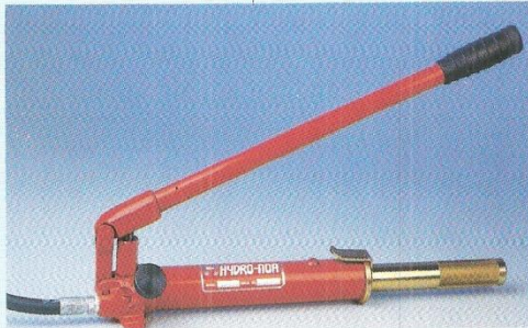
HAND PUMP HN-1830

*WEIGHT.....3.6 Kg *LENGTH.....540 mm *WIDTH.....80 mm *POWER.....500 Bar